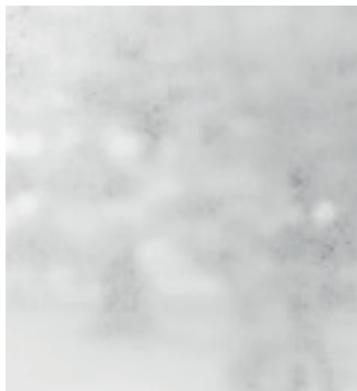
Acryl glass dull and worn