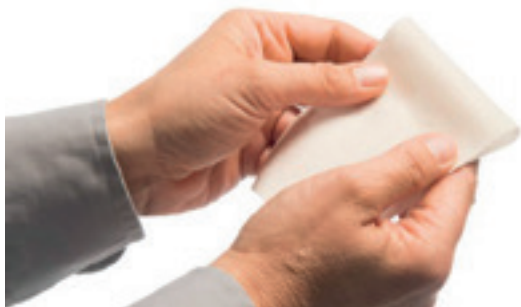
Extremely flexible to achieve a superb finish. Very uniform surface finish