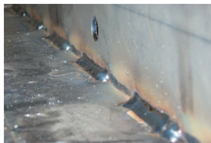
Concave weld seam grinding