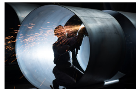
Tube and container constructions