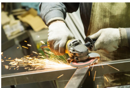
General weld seam grinding