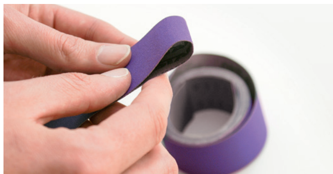
Maximum flexibility for perfect grinding of profiles and curves