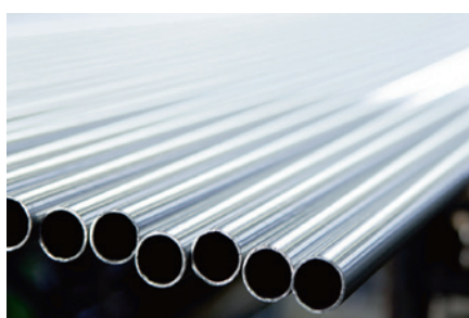
Grinding of round piping and rectangular tubing