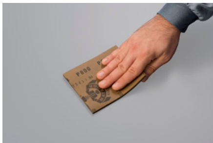
Automotive industry - E-coat sanding