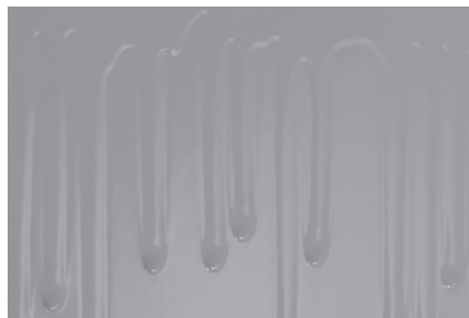
Sanding off paint runs