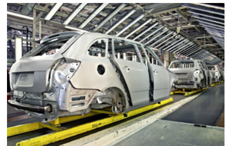
Sanding off PVC-Overspray