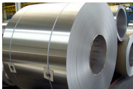
Stainless steel coil- and sheet grinding