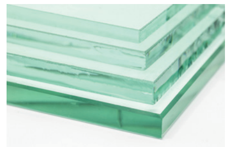
Glass industry | Deburring of cutting edges