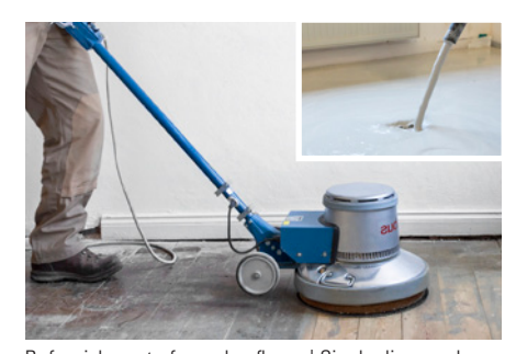
Refurnishment of wooden floors | Single disc sander Sizing of screed floors | Single disc sander