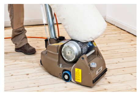
Refurnishment of wooden floors | Sleeve sander