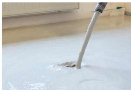
Screed floor | Sizing