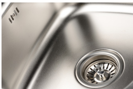
Stainless steel kitchen sinks