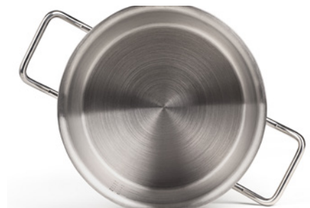
Stainless steel cookware