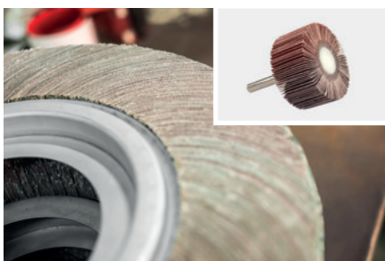
Base material for flap wheels and spindle wheels