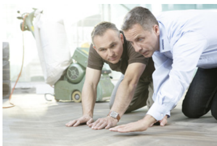
Parquet - Pre- Intermediate- and Finish sanding