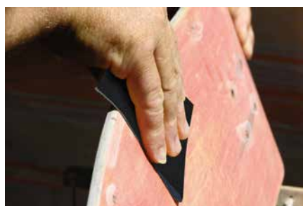
Wood and furniture