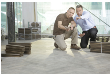
Parquet - Calibration