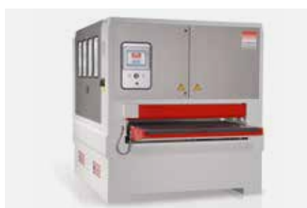
Wide belt sanding in the wood working industry