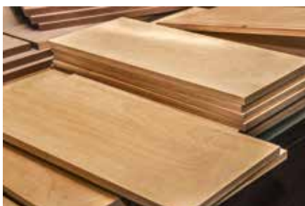
Solid wood boards and veneer surface boards