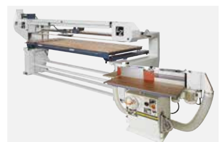
Longbelt sanding and edge belt sanding in the wood working industry