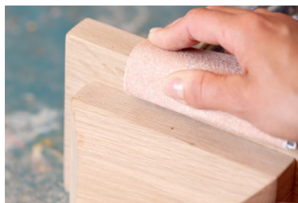
Furniture hand sanding