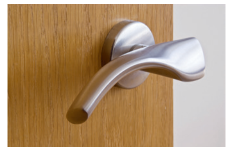
Aluminium door handles and dress plates