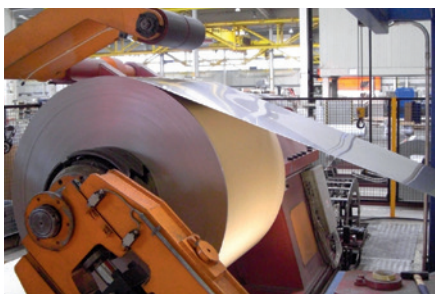
Coil and thin plate processing