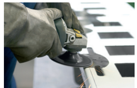
General metal working