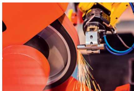
General backstand grinder processing