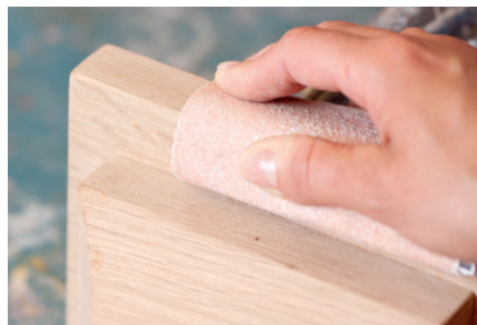
Wood and Furniture industry