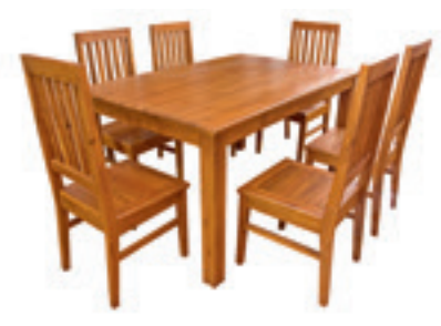
Wood and furniture industry