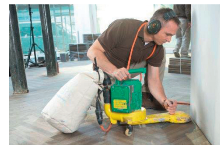
Solid parquet and floor boards