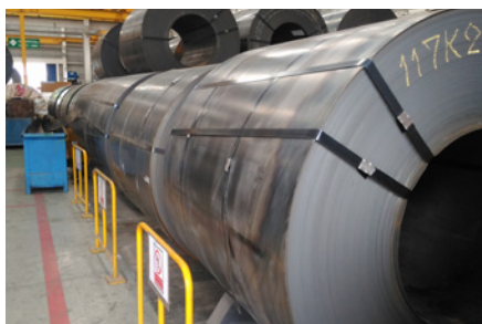
Coil | Removing of black scale and mill scale