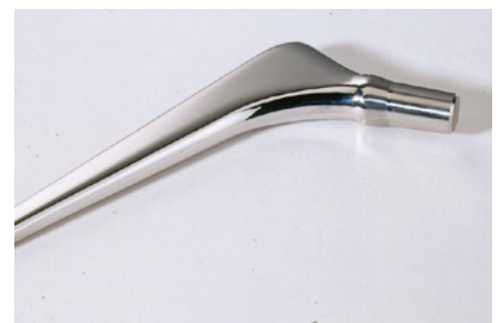
Stainless steel implants | Green body deburring