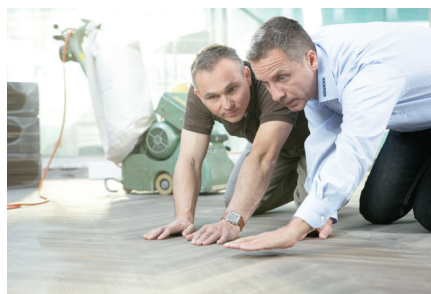
Sanding belts | Plane and Finish sanding