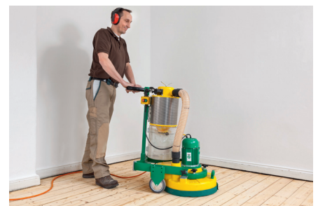
Sanding discs | Pre- and Finish sanding