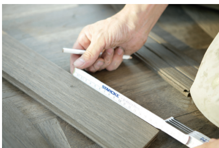
Solid parquet and boards